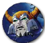
1 Unicron Turn Marker