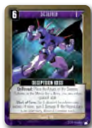
9 Boss Cards