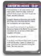
3 Reference Cards