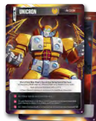
1 Giant Character Card