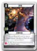
10 Unicron Starter Cards