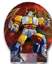
1 Giant Standee with base