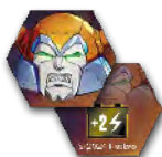
8 Herald Tokens