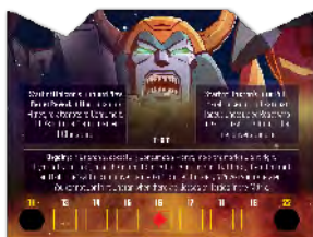
1 Unicron Tile