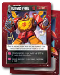
6 Oversized Character Cards