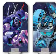
6 Player Standees with bases