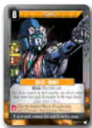
42 Main Deck Cards