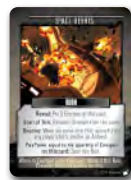
5 Planetary Ruins