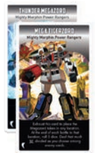
2 Megazord Cards