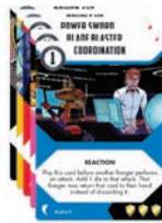
50 Combat Cards