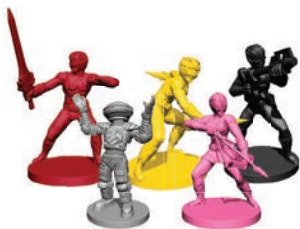
5 Ranger Figures