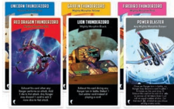
6 Zord Cards